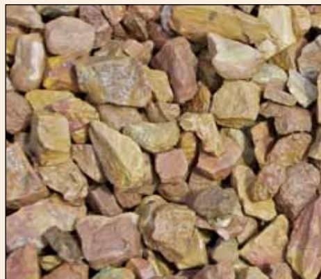
Bryan Rock shown 1 1/2"