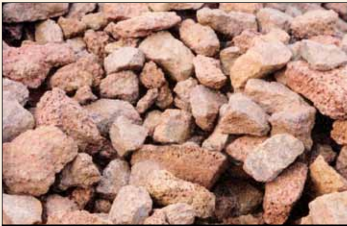
Pitted Breaker Run shown 3-6"