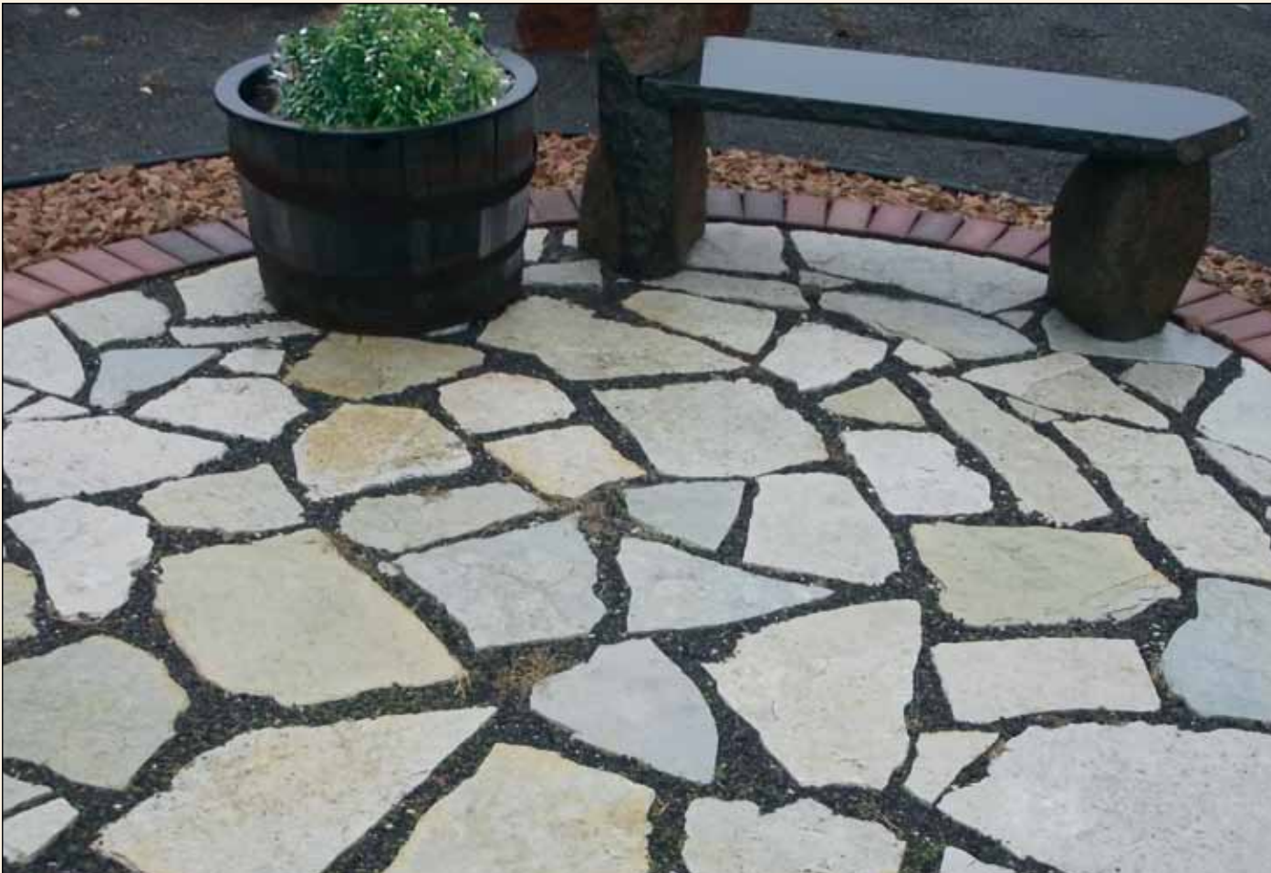
Door County Flagstone