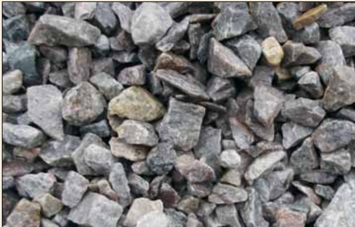
Shimmering Smoke shown 1 1/2"