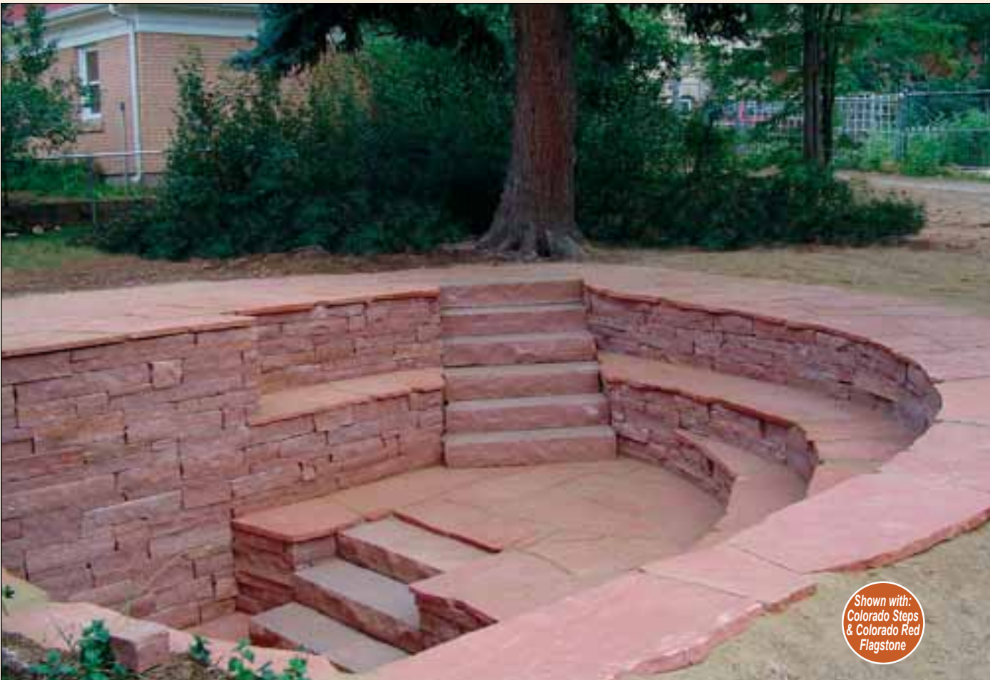
Colorado Red 8" Cut Wallstone