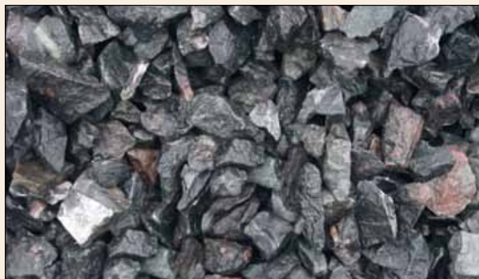
Becker Blue shown 1 1/2"