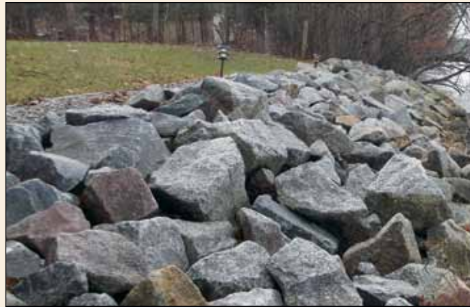
Pewter Gray Boulders