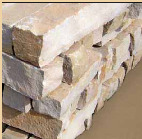
Border Edge Stone