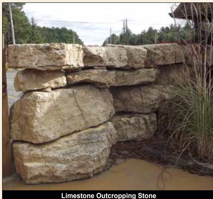
Limestone Outcropping Stone