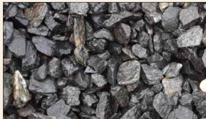
Black Crystal shown 1 1/2"