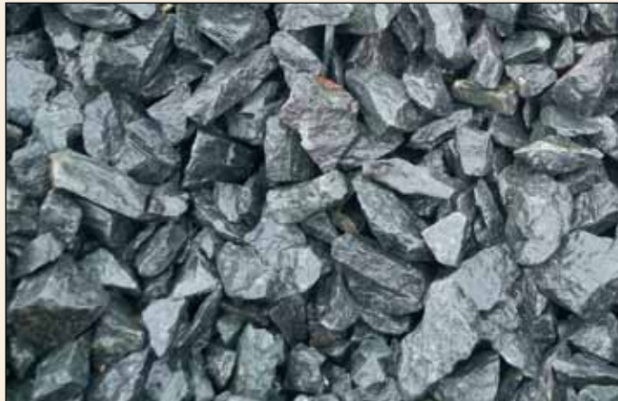
Trap Rock shown 1 1/2"