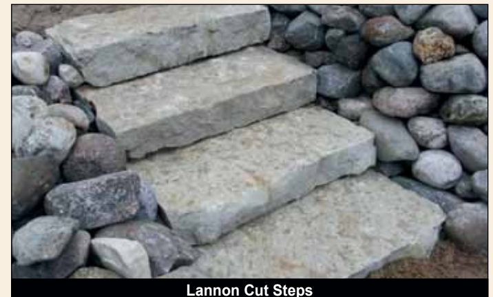
Lannon Cut Steps