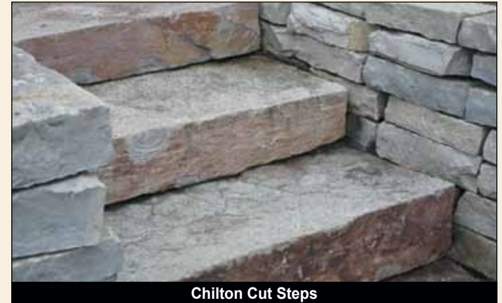
Chilton Cut Steps