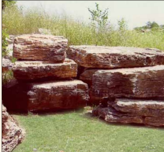
Flyway Weathered Outcropping