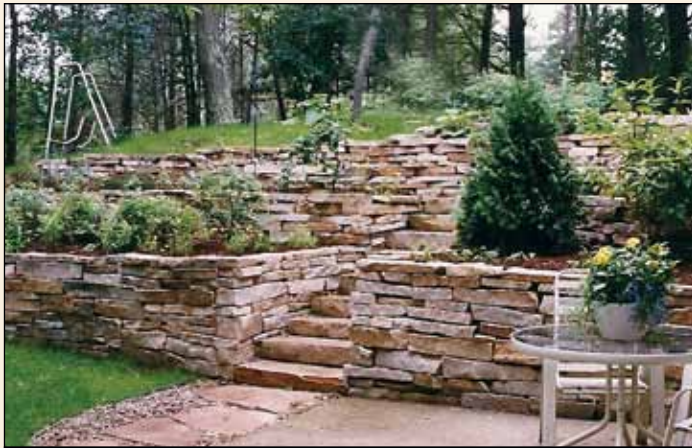
Copper Mountain Random Wallstone