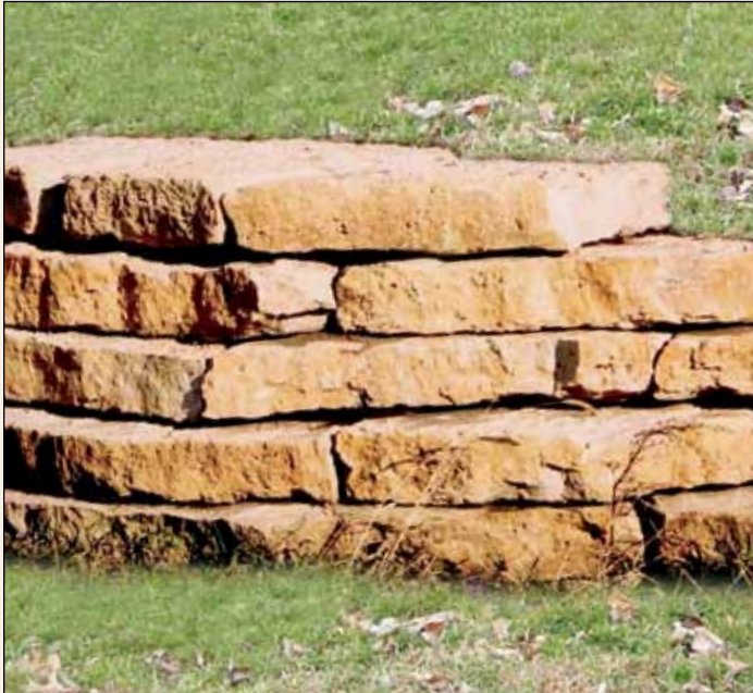
Weathered Edge Outcropping Stone