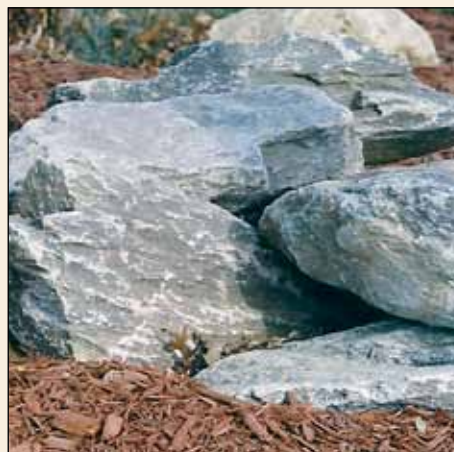
Shimmering Smoke Boulders