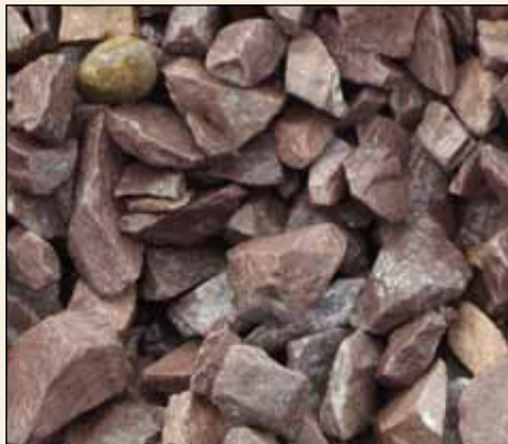
Lavender Quartz shown 1 1/2"