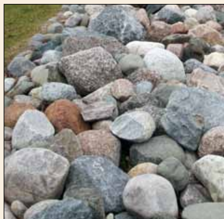
Rustic Cobblestone shown 8-18"