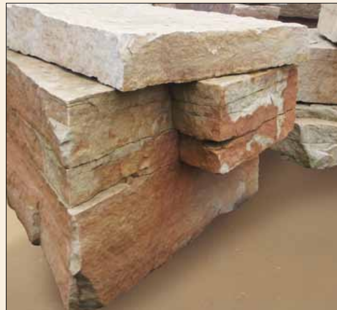
Copper Mountain Outcropping Stone