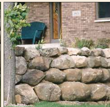
Sorted Fieldstone shown 18-24"