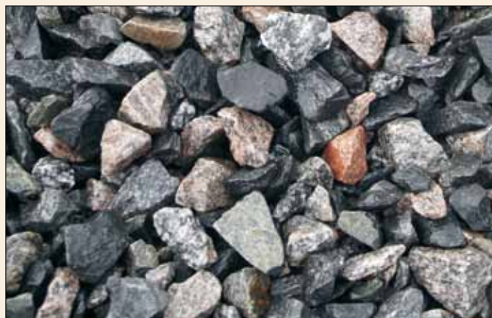
Pewter Gray Rock shown 1 1/2"