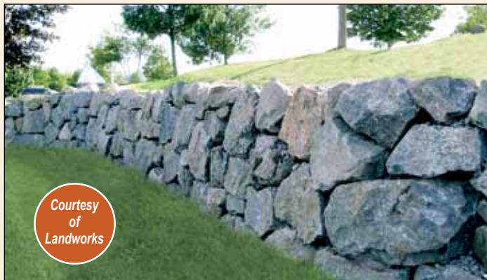
Becker Blue Boulders

Boulders provide a wide range of uses including natural retaining walls, shoreline protection, and waterfalls. These natural stones will last a lifetime and will have little to no movement caused by frost heaving or settling. No worries about decomposition.