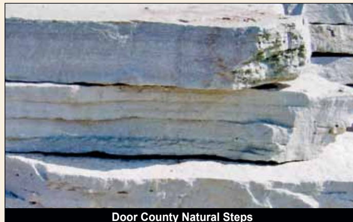
Door County Natural Steps