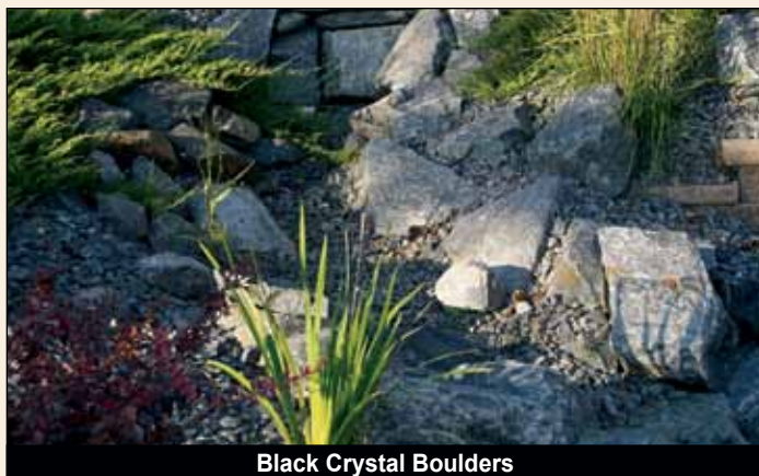
Black Crystal Boulders