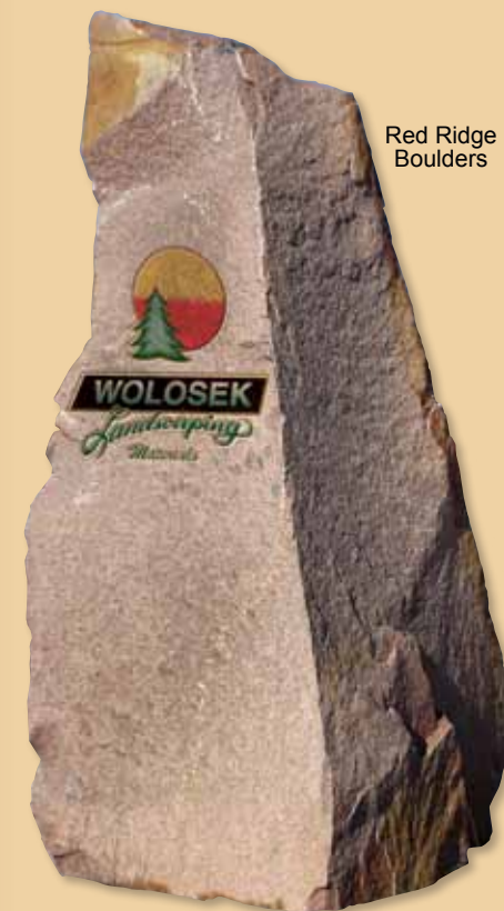
Red Ridge Boulders

Various shapes and sizes available Red colors with charcoal accents