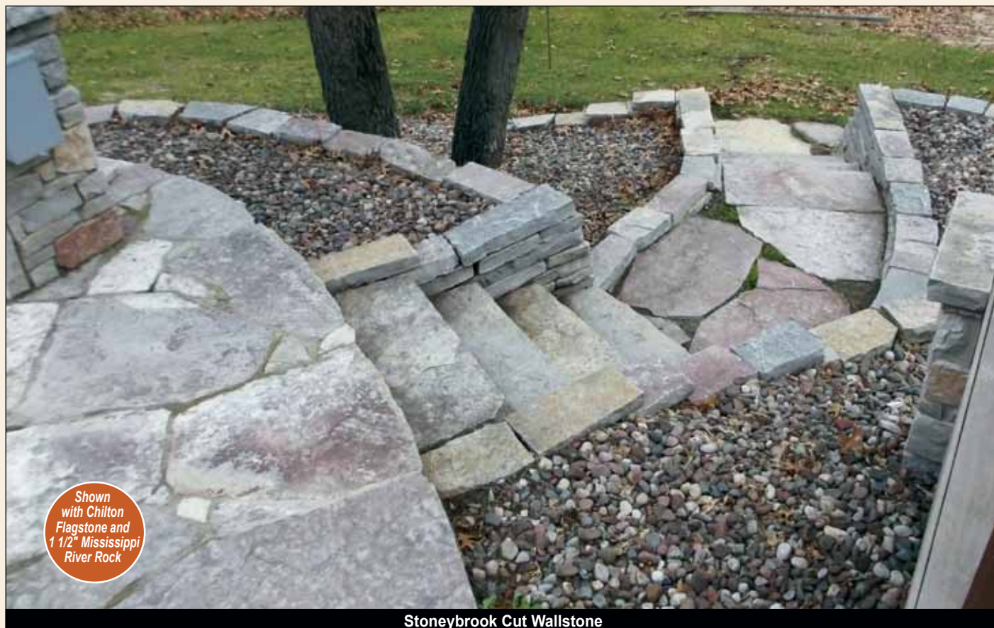
Stoneybrook Cut Wallstone