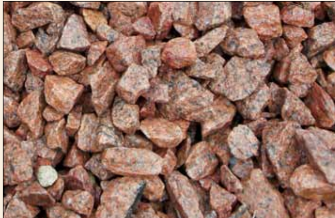
Ruby Red Rock shown 1 1/2"