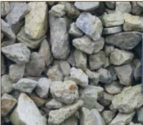
Cream Rock shown 1 1/2"