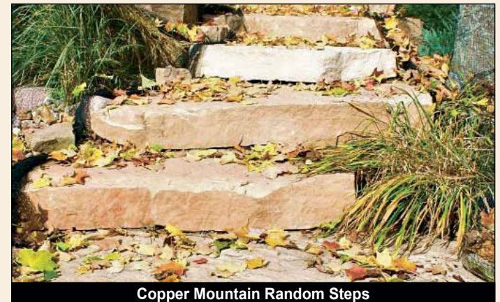
Copper Mountain Random Steps