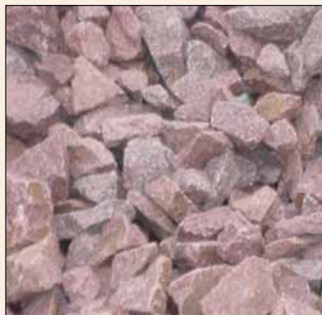
Ruby Breaker Run shown 6-8"