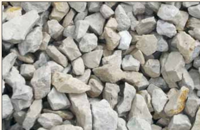
White Rock shown 1 1/2"