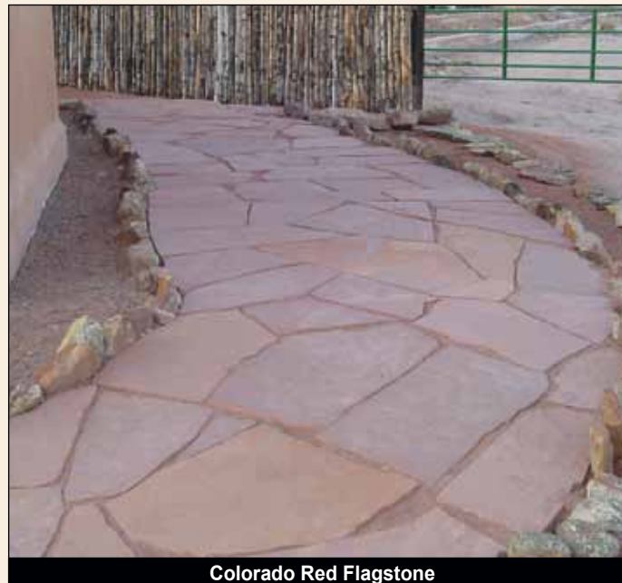
Colorado Red Flagstone