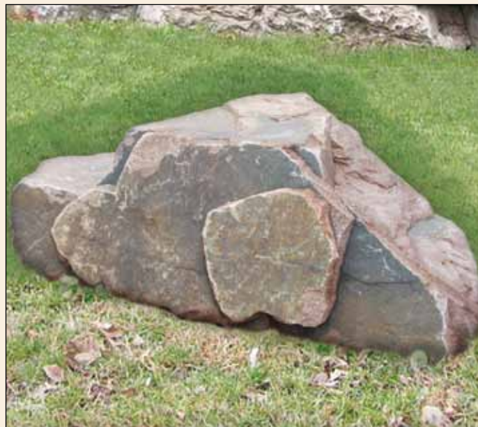
Red Ridge Boulders