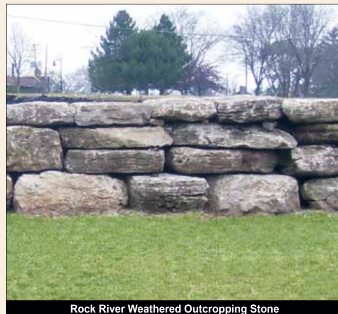
Rock River Weathered Outcropping Stone