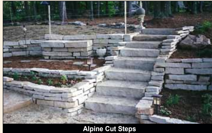
Alpine Cut Steps

Natural Stone Steps are solid natural steps that are cut to specifications. They will last forever and stay where you put them.