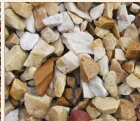
Caramel Quartzite shown 1 1/2"