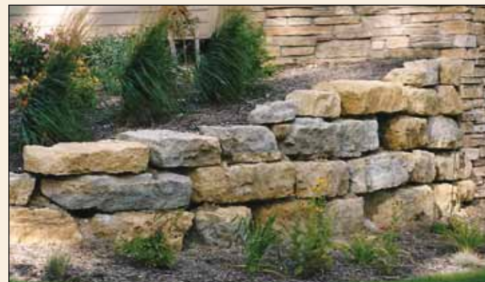
Blended Gray / Lime Retaining Wallstone