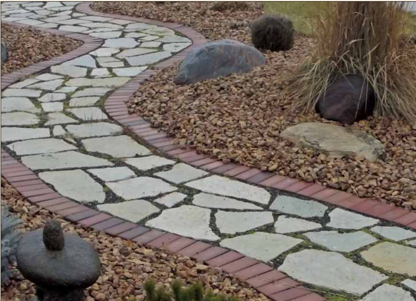
Bryan Rock shown

Deep dark red, rich in color; pitted rock