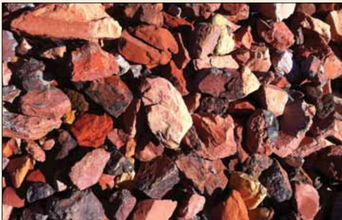
Western Sunset shown 1 1/2"