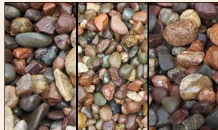
(O) shown 1 1/2"