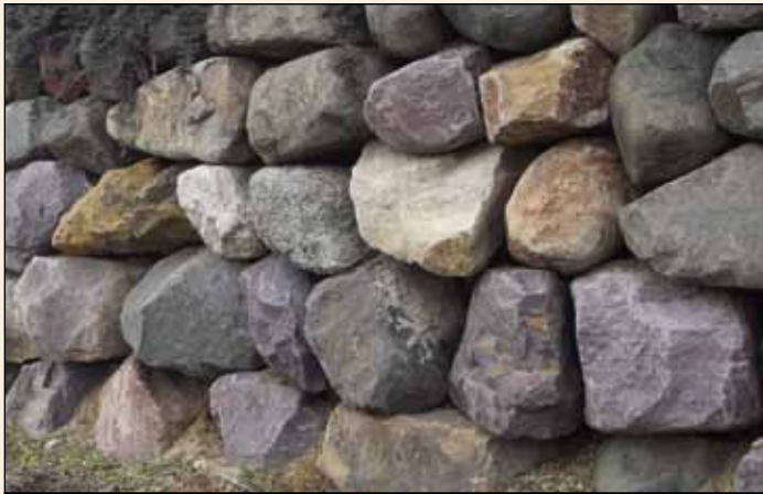
Fox Ridge Boulders