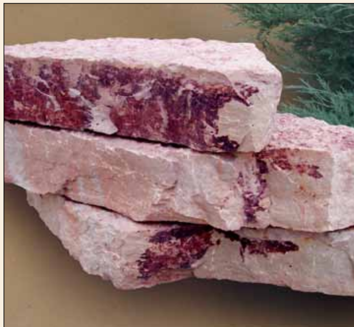
DePere Weathered Edge Outcropping Stone

Size: 2-3' length, 12"-3' width, 5-10" height 3-5' length, 2-4' width, 6-12" height Color: Earthtone weathered pitted rock