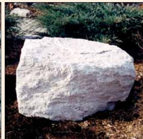
White Lime Boulders