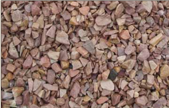
Rose Rock shown 3/4"