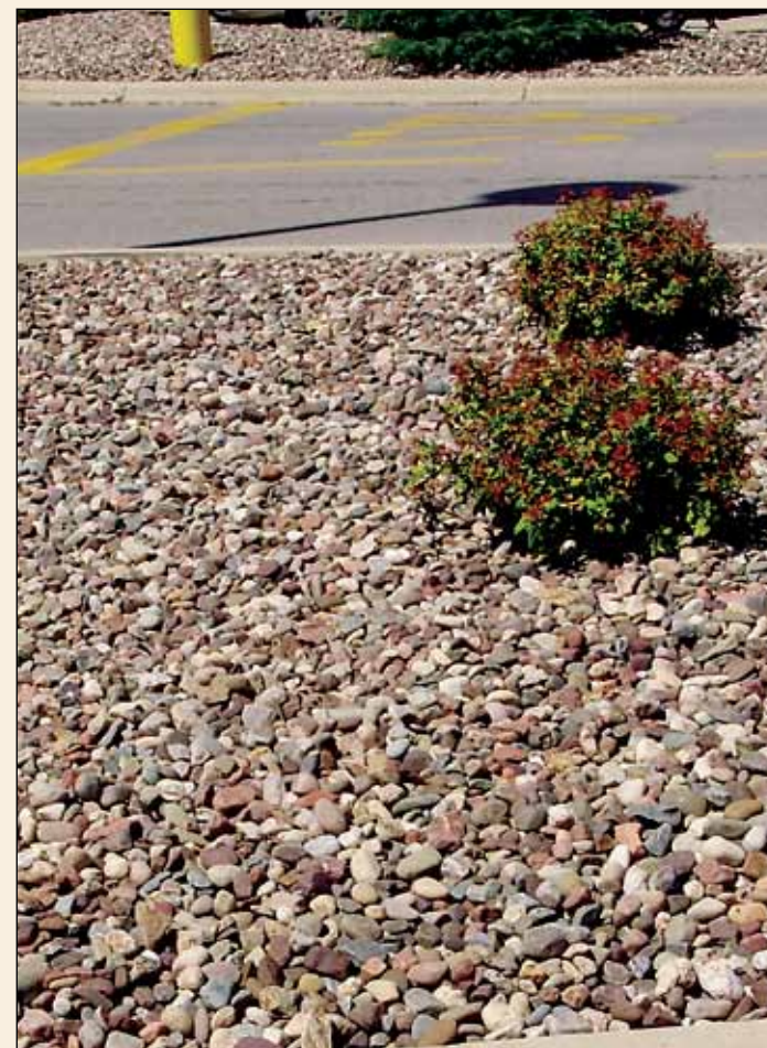
Mississippi River Rock (O) shown 1 1/2"