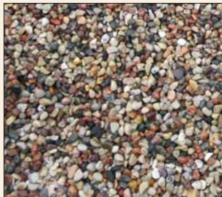
Buckshot Gravel shown 3/8"