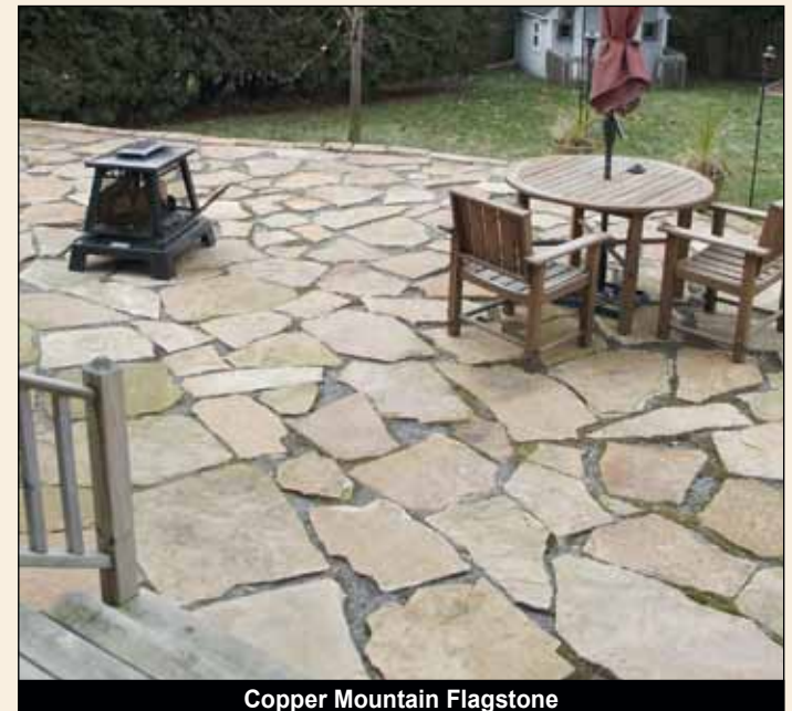
Copper Mountain Flagstone