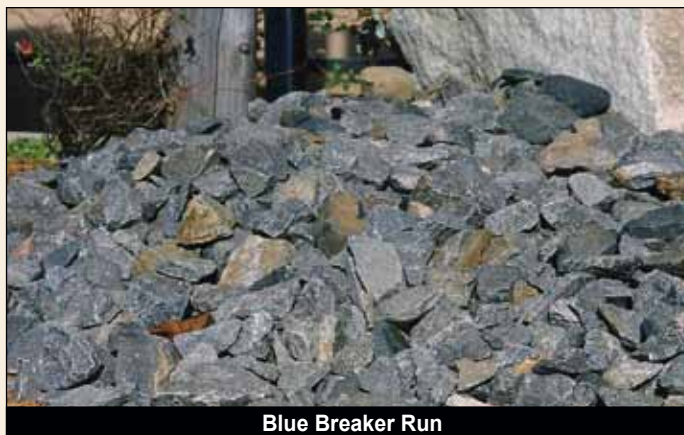
Blue Breaker Run