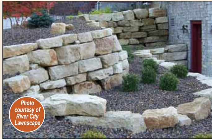
Limestone Retaining Wallstone