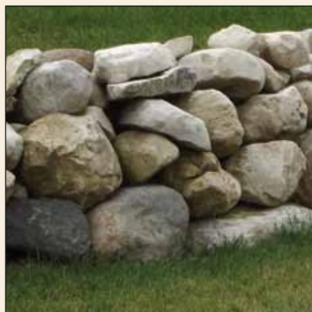
Cream Round Boulders