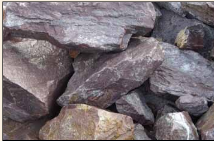
Lavender Quartz Boulders