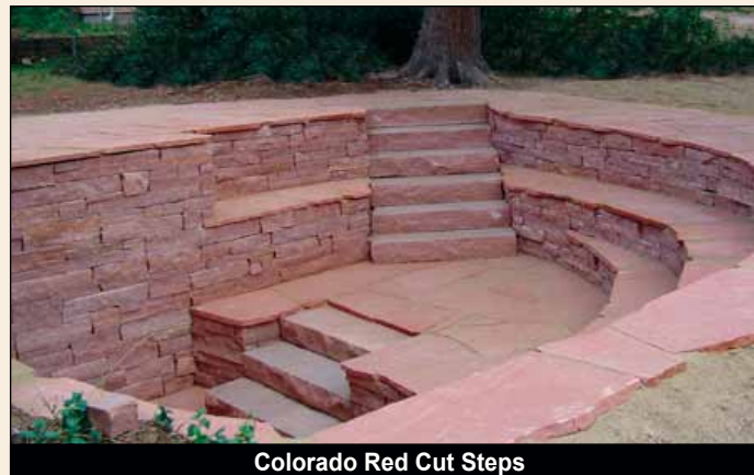
Colorado Red Cut Steps