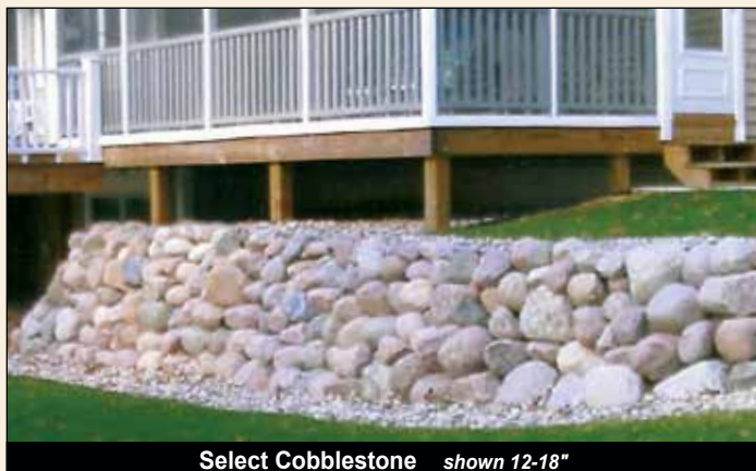
Select Cobblestone shown 12-18"