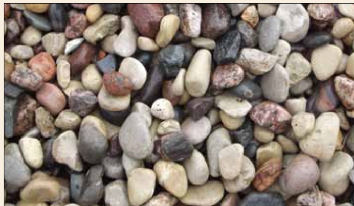
American Heritage shown 1 1/2"