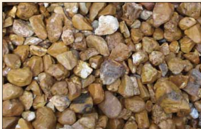
Meramec shown 1 1/2"

Round, smooth tannish-yellow tones with white rock