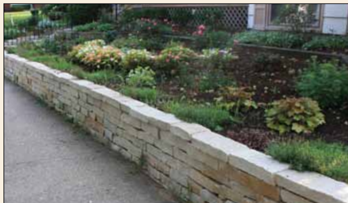
Alpine 8" Cut Wallstone