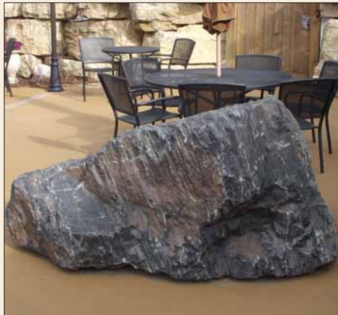
Becker Blue Accent Boulders