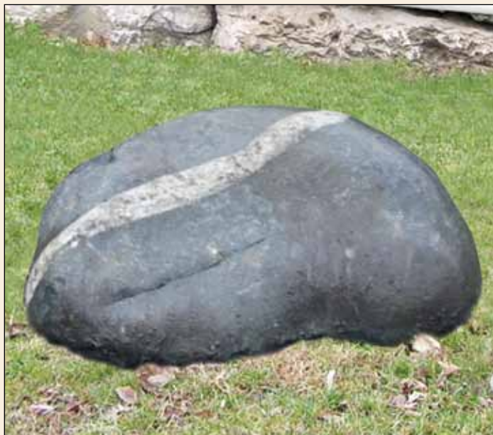
Cobblestone Accent Boulders