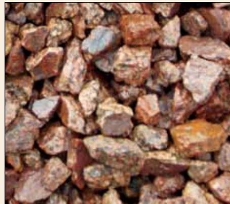
Maroon Nuggets shown 2 x 1"